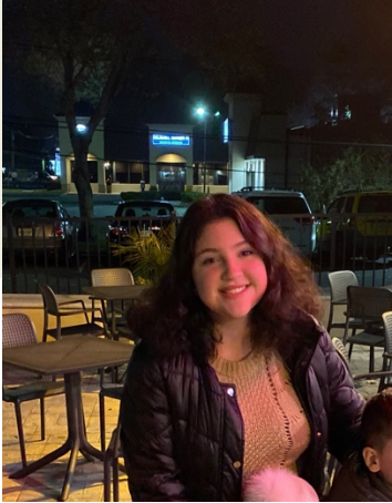
Photo my mom took of me. Pretty sure it's on her Facebook. Cropped out my cousins.

DIVE INTO THE PEOPLE RUNNING TO BE YOUR PRESIDENT