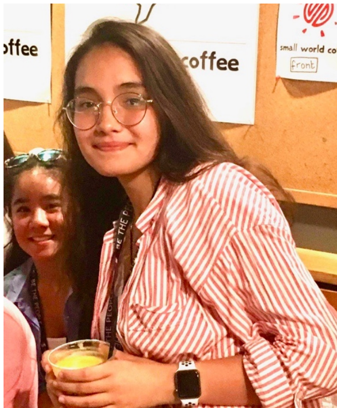
Congresswoman Karimova volunteering in Libya '2017'

The Human Voting Rights Act was passed to ensure that all voting procedures in Fortis were than of a direct democratic approach. Congresswoman Karimova expressed to me how important equal rights were to her. Congresswoman Karimova promises to: prioritize citizen's voice in the affairs of the government, ensure access to quality healthcare for all, ensure access to all levels of quality education, stabilize trade and international affairs with neighboring countries, develop and technological innovation of Fortis, and bring Fortis back to the top of the world economy. It is important to her that political schematic corruption within the Fortis Chambers and courts to a complete end. She believes Fortis deserves a stable government and a prosperous economy that meets the needs of all.