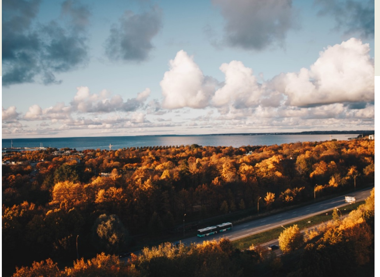
Arial view of the stunning nature in Fortis.